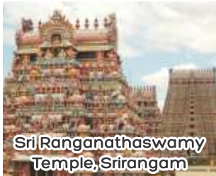
Sri Ranganathaswamy Temple, Srirangam