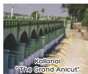
Kallanai "The Grand Anicut"