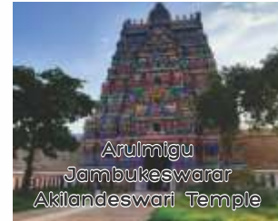
Arulmigu Jambukeswarar Akilandeshwari Temple