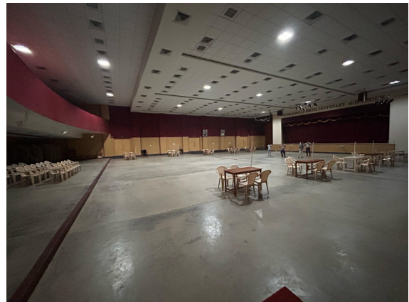
WAITING/ DINING SPACE