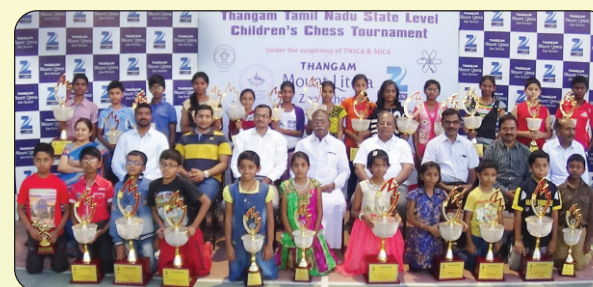
Previous Year Winners - 2016