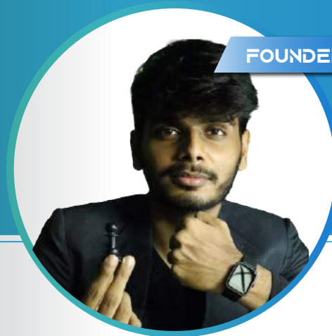
FOUNDER, CASTLE RED