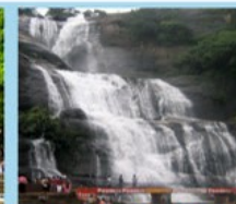
Main Falls Courtalam