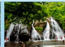
Five Falls courtalam