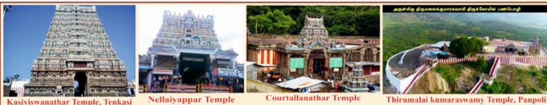
Kasivishwanathar Temple, Tenkasi Nellaiyappar Temple Courtallanathar Temple Thirumalai kumaraswamy Temple, Panpoli